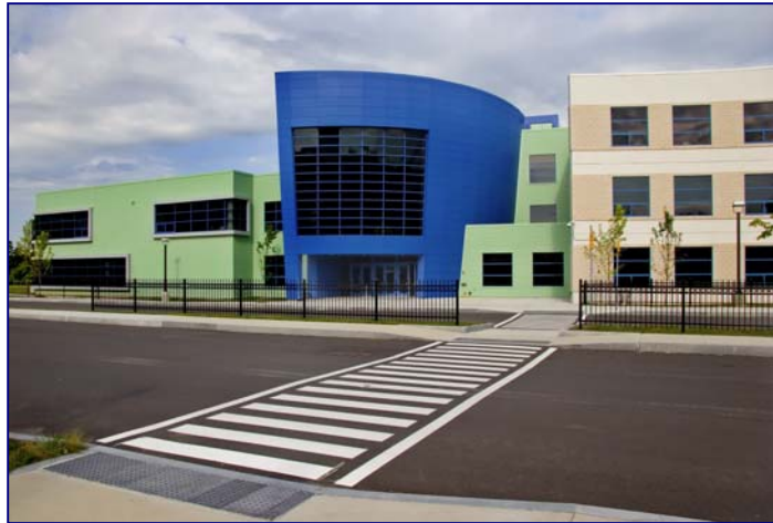
Stephen and Harriet Myers Middle School opened in 2005.

Students will attend either Stephen and Harriet Myers Middle School on Whitehall Road or William S. Hackett Middle School on Delaware Avenue based on the elementary school they attend ( see related stories ).